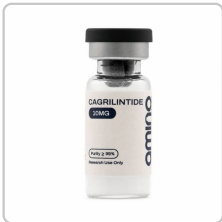
Cagrilintide 10mg - CAG0001

Identity: Cagrilintide Peptide Purity: 99.04%