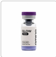
GLOW 70mg - GLW0001