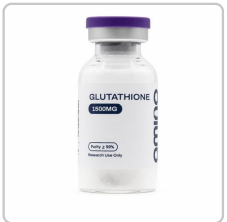
Glutathione 1500mg - N/A