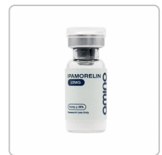
Ipamorelin 10mg - IPA0001

Identity: Ipamorelin Peptide Purity: 99.63%