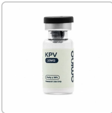
KPV 10mg - KPV0001