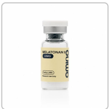
Melanotan II 10mg - MII0001