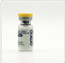
CJC-1295 5mg + Ipamorelin 5mg no DAC 10mg - CIP0001