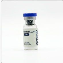
Epithalon 10mg - EPI0001