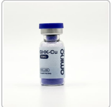
GHK-Cu 50mg - GHK0001