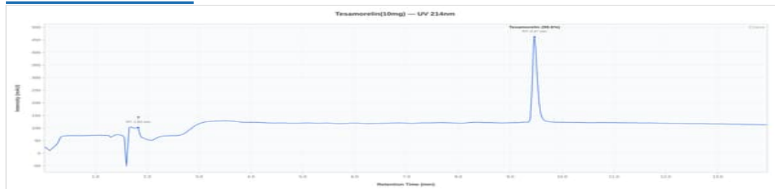
Representative chromatogram, Conformity V1 (99.34% purity, closest to batch mean of 99.47%)