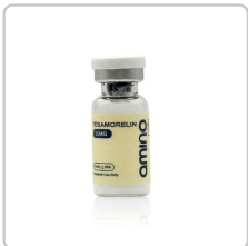
Tesamorelin 10mg - TES0002